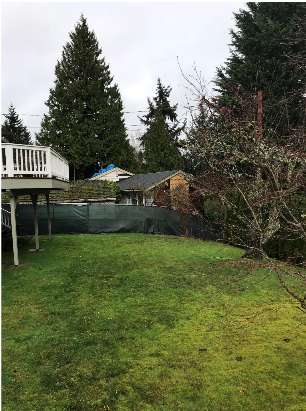
Exhibit 2-B: Replacing exterior sheathing; unlawful continuance in violation of posted stop work order. 01/12/2021