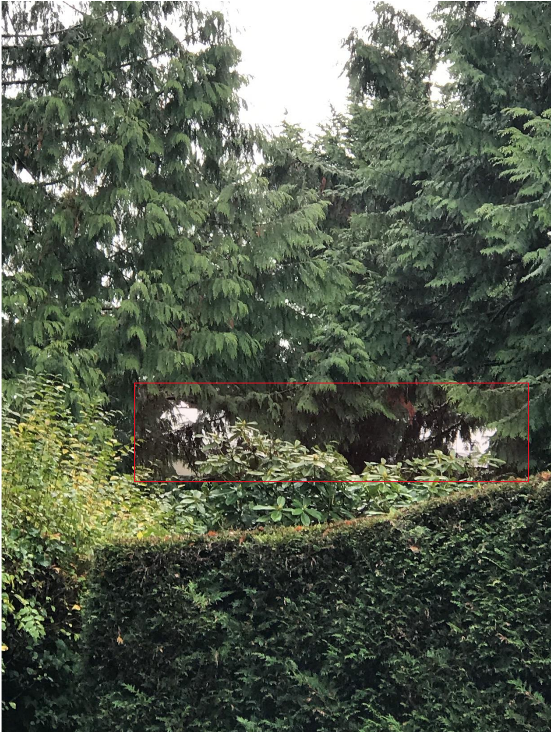
Exhibit B: New roof built over existing second story deck, unlawful continuance in violation of posted stop work order. Photo taken 01/12/2021.