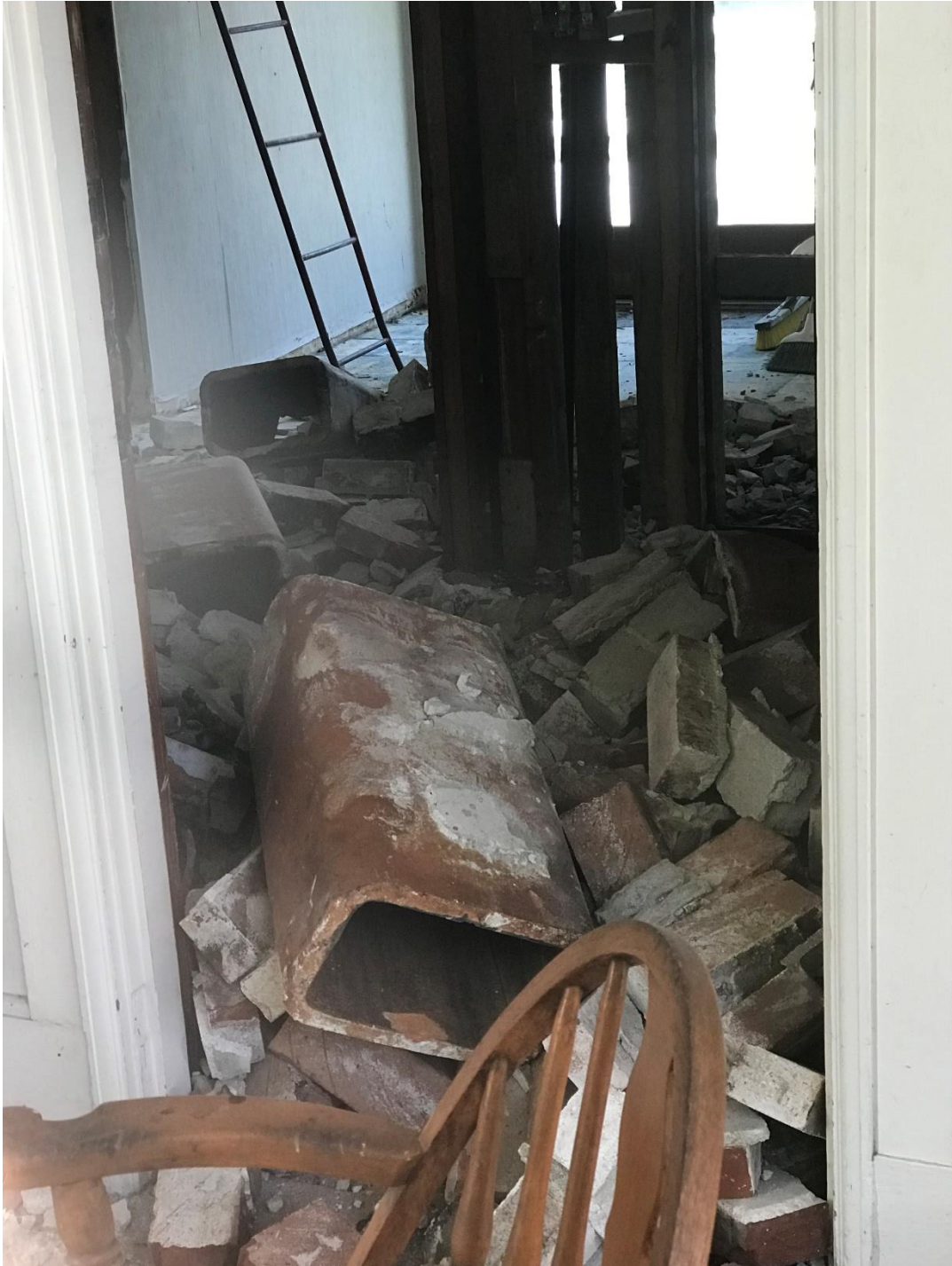
Exhibit 4-A: Initial investigation and stop work order posted. Demolition of walls and chimney, seen in plain view through clear glazed front entry doorway. Photo taken 10/12/2020.