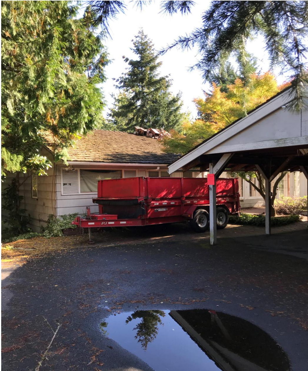
Exhibit 1-A: Initial investigation and stop work order posted. Barcelo Homes Inc. Equipment; chimney demolition material seen on roof; SWO posting. Photo taken 10/12/2020.