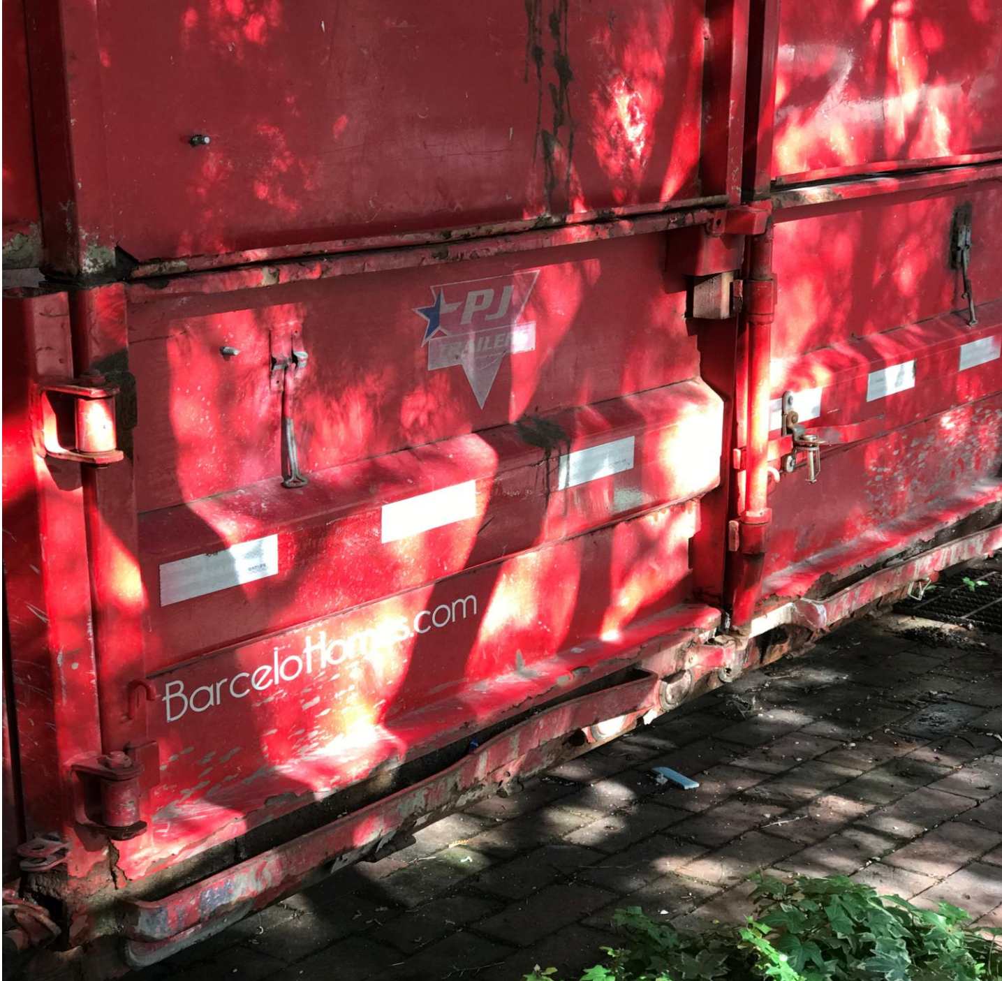
Exhibit 2-A: Initial investigation and stop work order posted. Barcelo Homes Inc. Equipment Photo taken 10/12/2020.