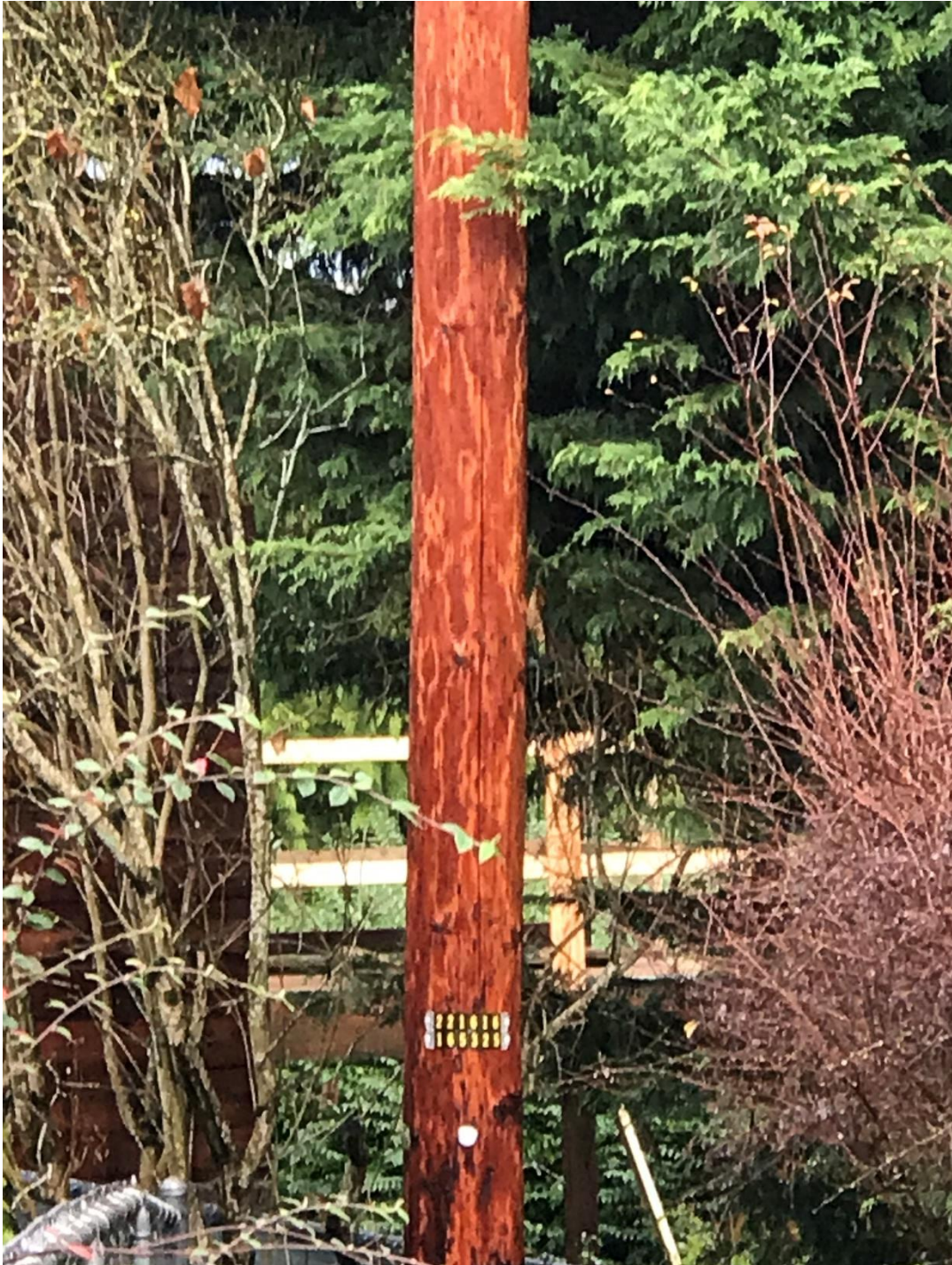
Exhibit 1-B: New roof built over existing second story deck; unlawful continuance in violation of posted stop work order. 01/12/2021