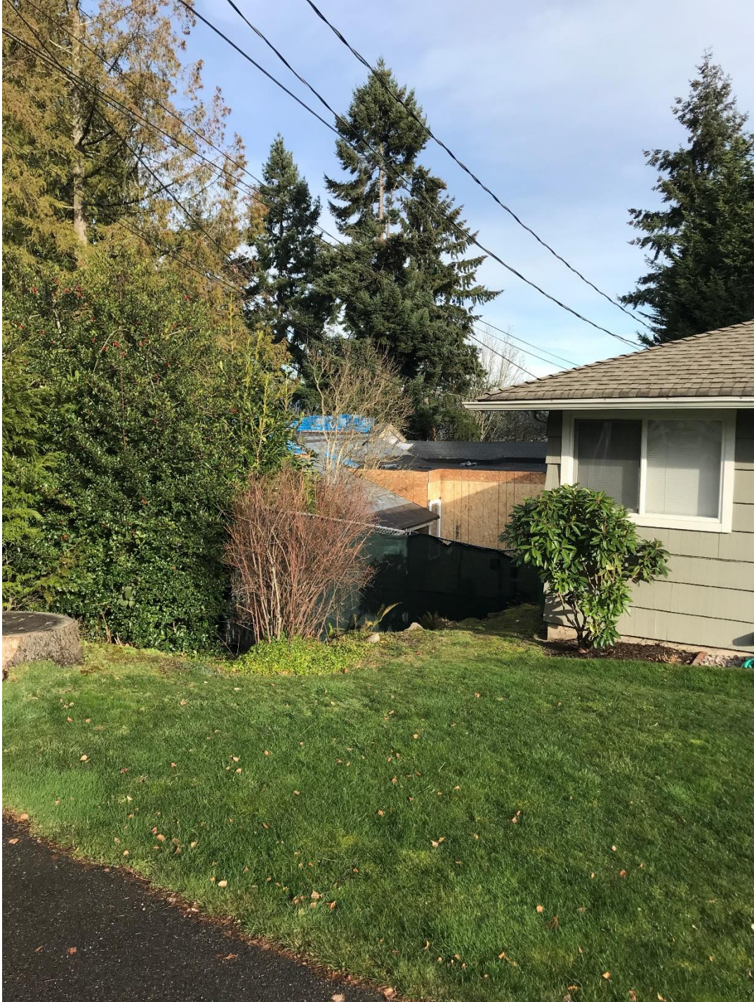
Exhibit C: Continuance of work in violation of SWO; Unpermitted addition. 01/27/2021